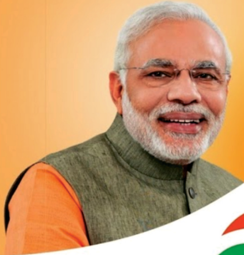
Shri Narendra Modi Hon'ble Prime Minister

Taking the power of digital to the next level. Empowering people. Enriching lives.