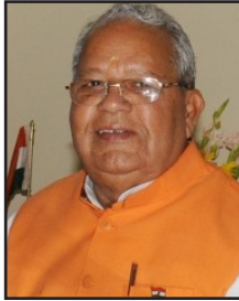
KALRAJ MISHRA Minister of MSME Government of India