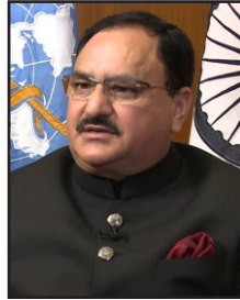
JAGAT PRAKASH NADDA Minister of Health & Family Welfare Government of India