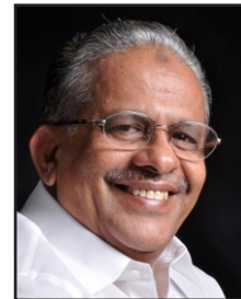
E.T. MOHAMMED BASHEER Ex. Education Minister Government of Kerala