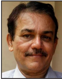
Prof. RICHARD HAY Member of Parliament Government of India