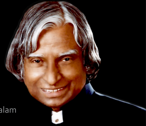
Dr. A.P.J Abdul Kalam Avul Pakir Jainulabdeen Abdul Kalam