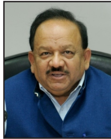
Dr. HARSH VARDHAN Minister for Science & Technology Government of India