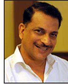
RAJIV PRATAP RUDY Minister for Skill Development Government of India