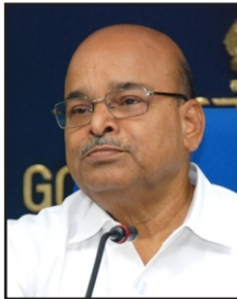
THAAWARCHAND GEHLOT Minister of Social & Empowerment Government of India