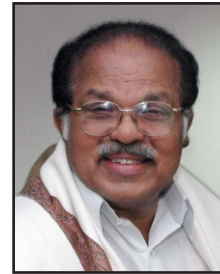
Prof. P.J. KURIEN Deputy Chairman, Rajya Sabha Government of India